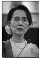
Aung San Suu Kyi 1945-

Walk on, walk on What you've got they can't deny it Can't sell it, can't buy it Walk on, walk on Stay safe tonight